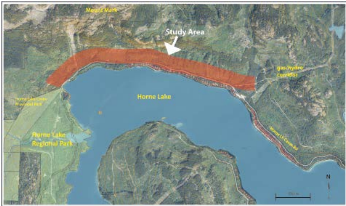
Map 3: RFP Study Area

The RDN seeks to understand the potential geohazards involved with routing public trail above Horne Lk Caves Road and below Mount Mark between the gas/hydro corridor and the entrances to Horne Lake Regional Park and Horne Lake Caves Provincial Park. The study area is shown below in Map 3: