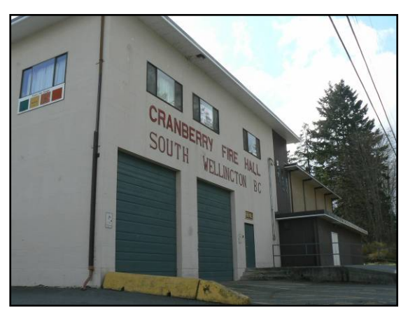
Cranberry Fire Hall – South Wellington