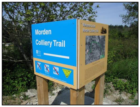
Morden Collery Trail Sign

It is important to note that while the Master Plan makes mention of issues related to parks, open space and the environment, the primary focus of the study was on the delivery of recreation and cultural services and facilities. The consultants, in discussion with the Project Advisory Committee, determined that, with rare exceptions, these issues would be referred to Regional District Parks staff as they are responsible for the ongoing planning and implementation of the Electoral Area "A" Community Trails Study that was completed in 2005 and any other current and future parks, open space and environmental initiatives.