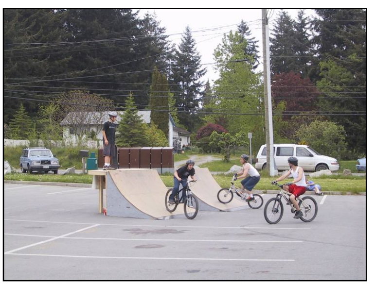
BMX riders honing their skills