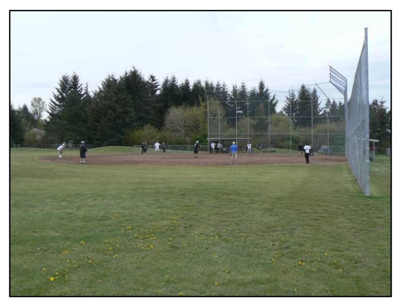
"Play Ball" – Wheat Sheaf Ball fields

26. Work with existing organizations to enhance the promotion of recreation opportunities.