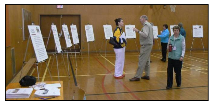
Open House – South Wellington Community Hall

Approximately 40 local residents attended an Open House on Monday, April 30, at the South Wellington Community Hall (Cranberry Fire Hall) to review the Draft Master Plan and provide comments that were considered in preparing the final report. The Advisory Committee, RDN staff and the consultants were in attendance to answer questions and discuss issues and concerns, a number of display panels provided an overview of the planning process and recommendations, and a questionnaire was available for further comment. The draft was then revised based on the feedback provided. A summary of comments is included in Appendix Five.