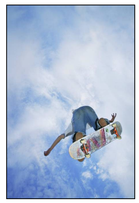
Skateboarding – a popular local activity