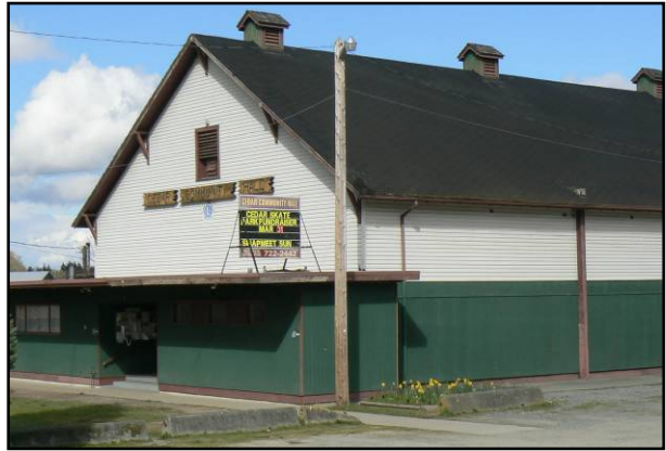
Cedar Community Hall