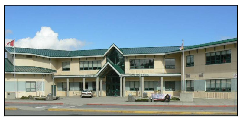
Cedar Community Secondary School

The successful implementation of the recommendations contained in the Master Plan will require significant cooperation and coordination between the Regional District and the proposed Commission, as well as existing organizations which currently provide an array or recreation and cultural opportunities. The appointment of the Commission and the employment of a recreation and culture services coordinator should be initiated at an early date, in order to ensure that the various initiatives are dealt with in a timely and efficient manner. From the consultants' perspective, the recommendations included in the Plan provide many opportunities for local residents to become engaged in an exciting initiative that will undoubtedly improve the overall delivery of leisure services in Electoral Area "A".