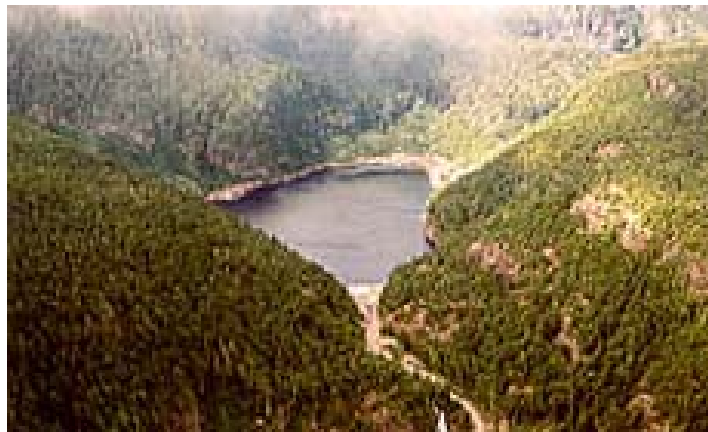
Regional District of Nanaimo