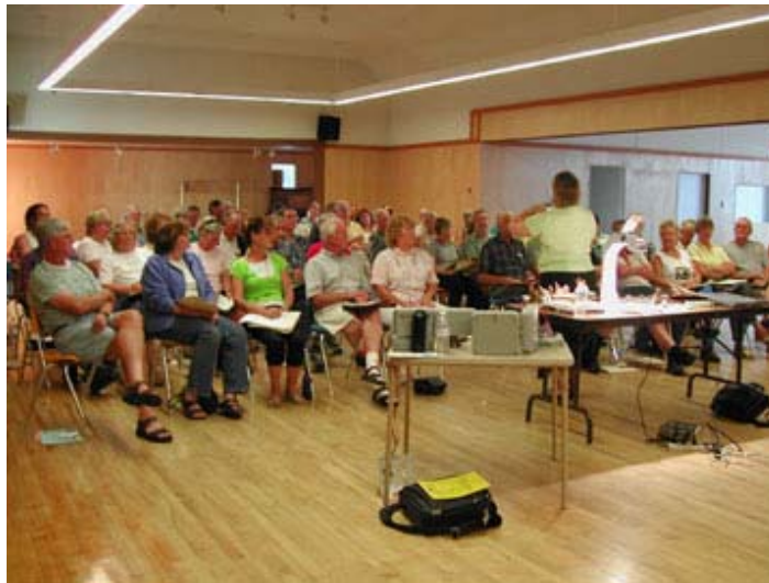
Xeriscaping workshop (Regional District of Nanaimo)

Finally, a DW-WP Committee-specific website was created for internal use by the Committee. This housed a range of resources relating to drinking water and watershed protection. The Committee’s agendas, meeting minutes and draft materials were also posted here for general reference, in addition to being distributed directly to Committee members. As a new communication tool, the website saw limited use during the life of the Committee. However, it may provide the starting point for future web-based information on the Drinking Water-Watershed Protection Action Plan.