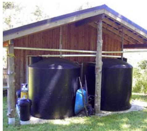
Rainwater collection cisterns (Aquarian Systems Inc.)