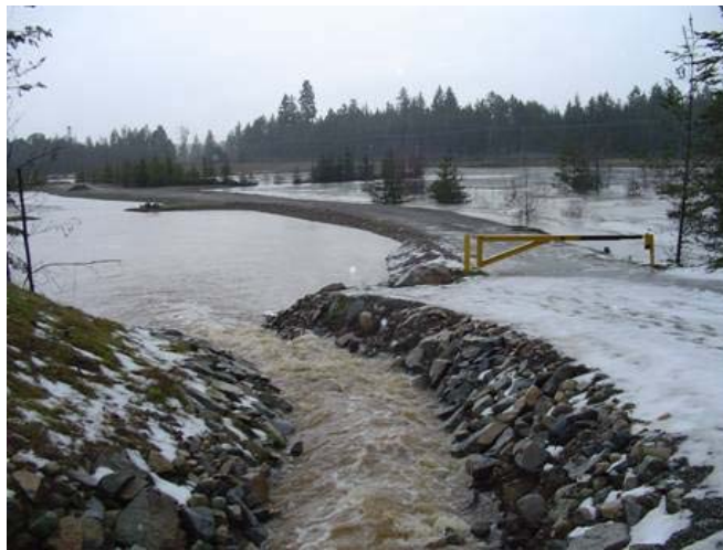
Water retention structure at River's Edge subdivision (T. Wicks)