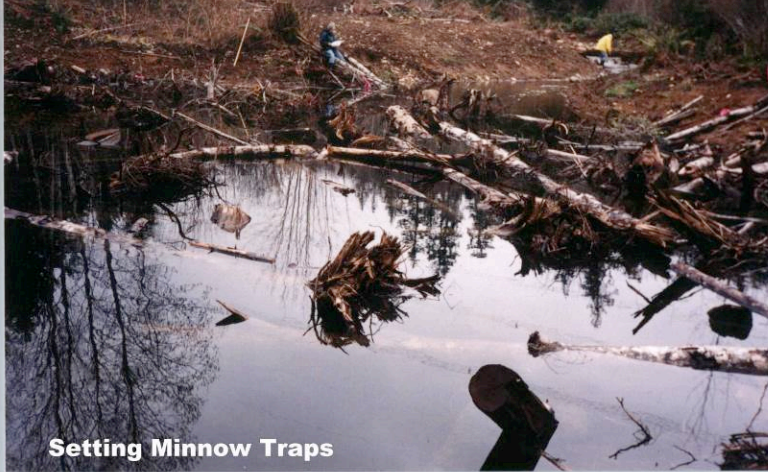
Setting Minnow Traps