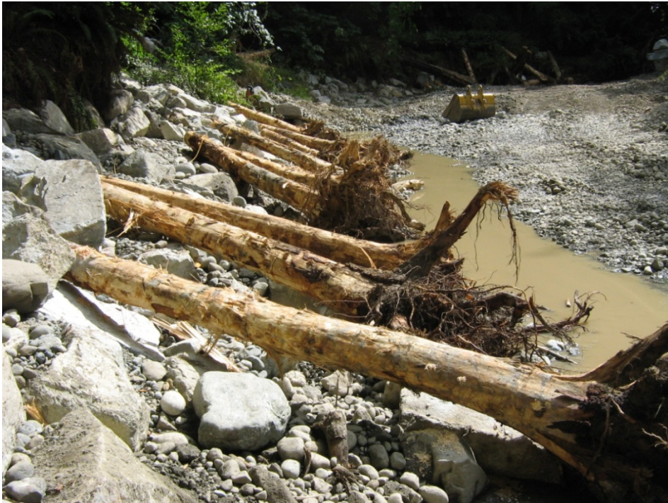
Photo 8. LWD was added to the linear riprap section to improve fish habitat values.