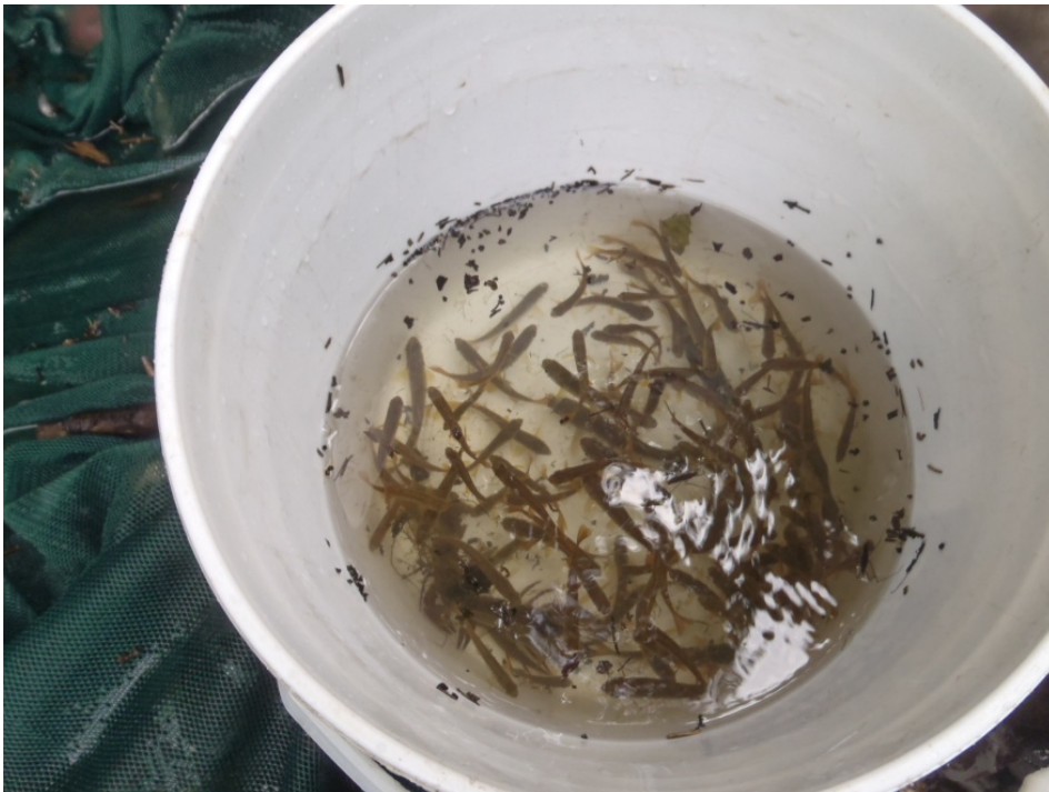
Photo 6. The salvaged fish were identified and enumerated, then released above or below the project site.