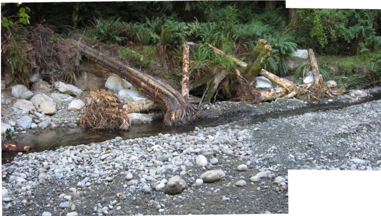
Photo 7. Tri-log structures were constructed at the upstream end of the site. Some riprap was installed behind the LWD to reduce bank erosion.

The linear riprap section downstream of the tri-log structures incorporated single stem logs with roots. The LWD is intended to add hydraulic variability, reduce near-bank water velocities, and create small scour pools and provide cover habitat (Photo 8). All LWD was anchored using boulder ballast secured with 12.5 mm diameter wire rope, clamps, and epoxy as per the design (Photo 9).