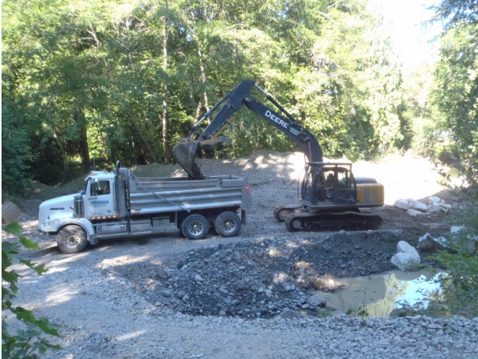
Photo 4. Approximately 250 m 3 of gravel was removed from the gravel bar and hauled off-site.