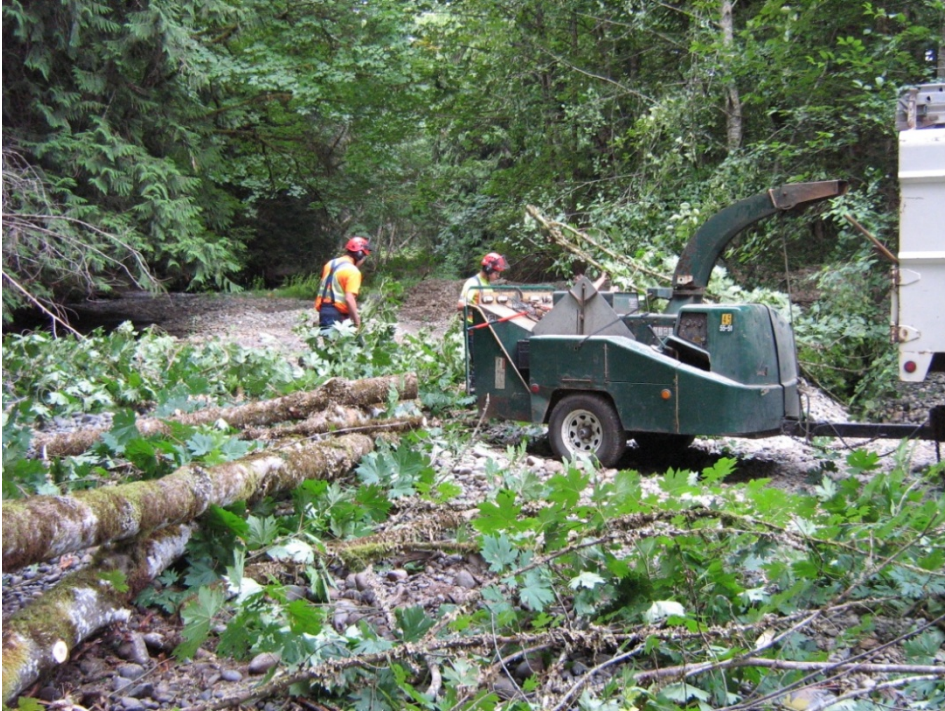
Photo 2. An arbourist removed several trees that were overhanging the creek. The tree roots were left intact on the bank.