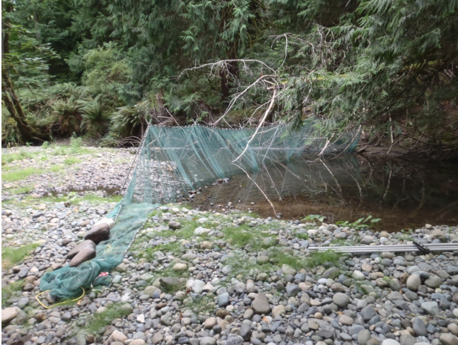
Photo 5. Stop nets were used upstream and downstream of the project site to isolate the area. Fish were removed between the stop nets.