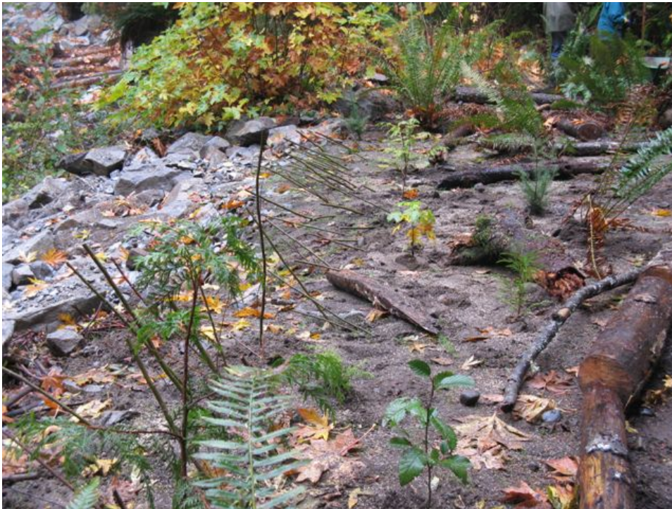
Photo 10. The stream banks and disturbed areas were revegetated with native plants. Local volunteers assisted with the planting work.

A riparian prescription was developed in early October, 2012. Planting was conducted with assistance from local fish and game/streamkeepers volunteer groups on October 26, 2012. Plants were obtained from the Nanaimo Area Land Trust (NALT) native plant nursery in Cedar, BC, as well as some sword fern salvaged from other areas of the park. Planting effort was concentrated at the access ramp area and the over-steepened banks at the downstream end of the site (Photo 10). Wood debris, primarily decomposing alder, was also added to the open disturbed areas to assist with plant survival; the dispersed wood debris adds nutrients, help retains moisture, and assists building soil. A list of the plants and cuttings planted is provided in Table 2. All the disturbed soil, including the left bank gravel bar, was seeded with a coastal revegetation seed mix (Table 3).