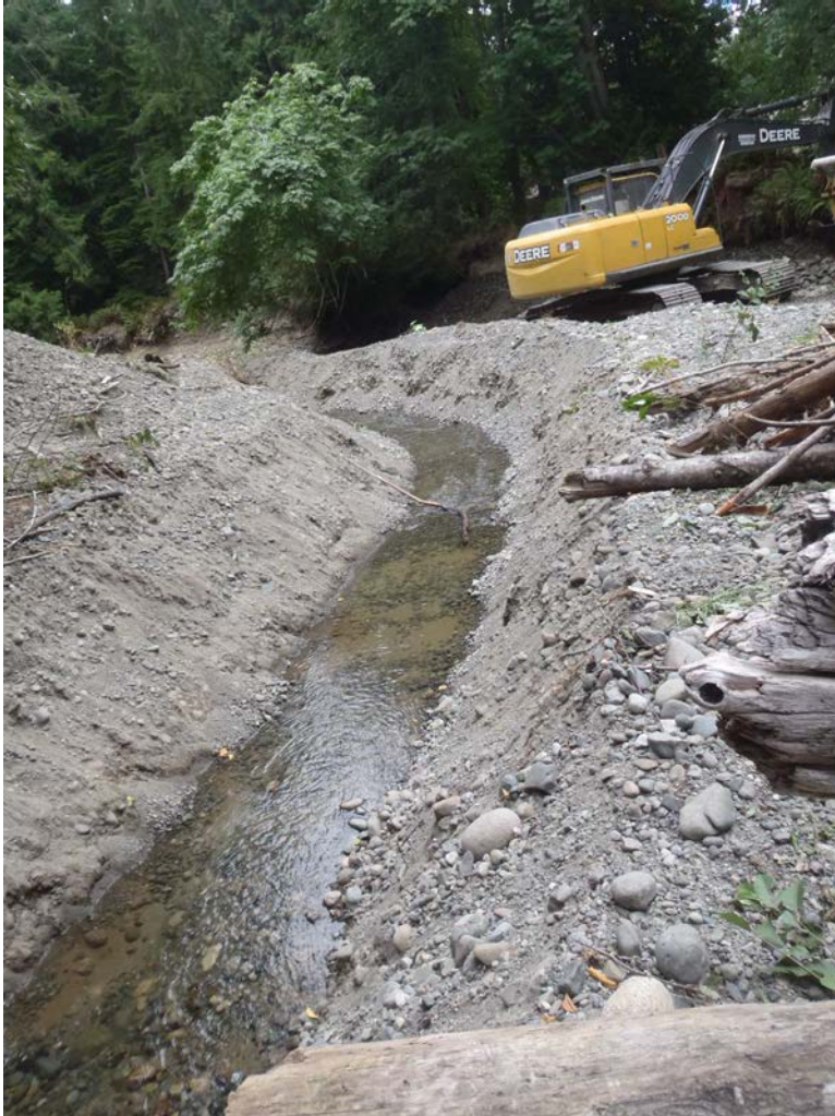
Photo 1. A channel was constructed on the left bank to divert the creek away from the work area. Fish passage past the work site was maintained. Silty groundwater seepage in the work zone was pumped to the left bank floodplain, and was allowed to percolate into the ground.