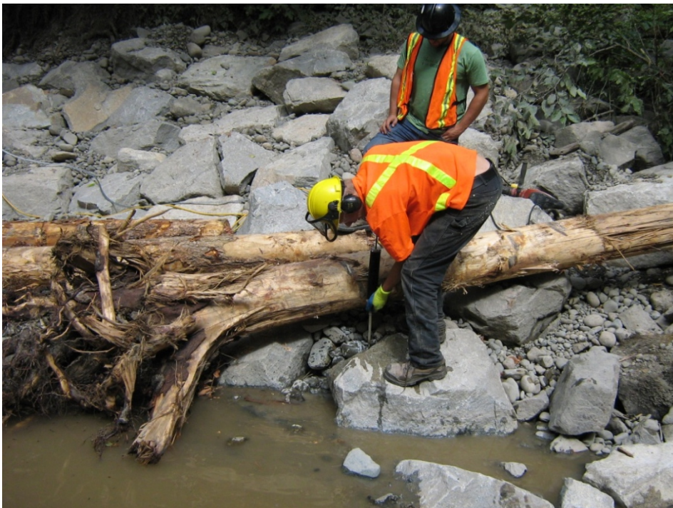
Photo 9. The BCCF crew anchored the LWD to boulders using wire rope, clamps, and epoxy.