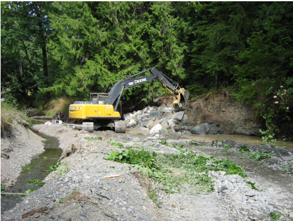
Photo 3. The eroding bank was prepared by grading the filter layer (gravel), and then riprap was keyed into the stream bed and extended up to the design elevation.