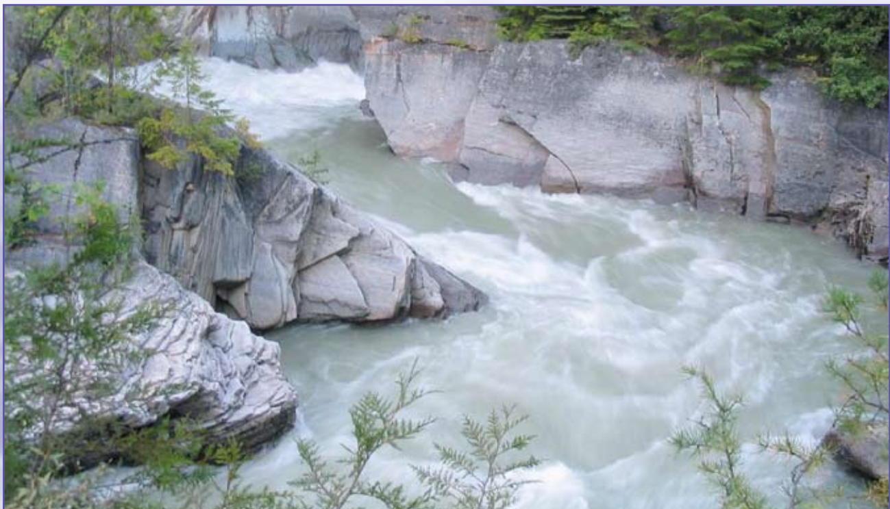
Ground water and surface water are interdependent.