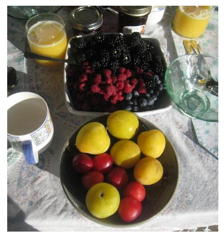
Figure 8. Fresh plums and berries, Fiddick's Farm, Cedar, Electoral Area A, RDN.

The actions recommended in the Implementation Table 7 in the following section (e.g. 1.1G, 7.2D, and 7.4A) are based on these findings and address the issues raised by some private landowners of large parcels that are currently not being farmed.