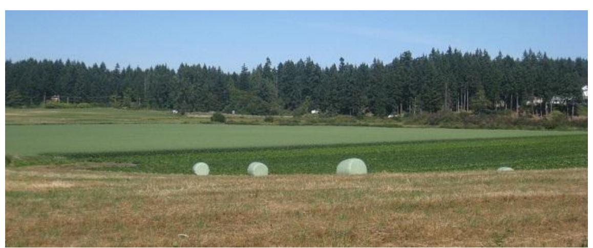
Figure 1. Hay and forage crops. Electoral Area C, RDN.

Together, the community insights, recommendations, and implementation framework outlined in this AAP make this Plan a 'living' and 'active' reference to guide decision-making in the RDN and build a spirit of collaboration with member municipalities and all citizens in the region to take action, big or small, in support of local agriculture and aquaculture as we continue 'Growing our Future', together.