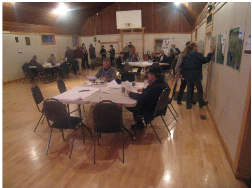
Figure 3. Agricultural Area Plan Open House, Errington Community Hall, November 3<sup>rd</sup>, 2011.