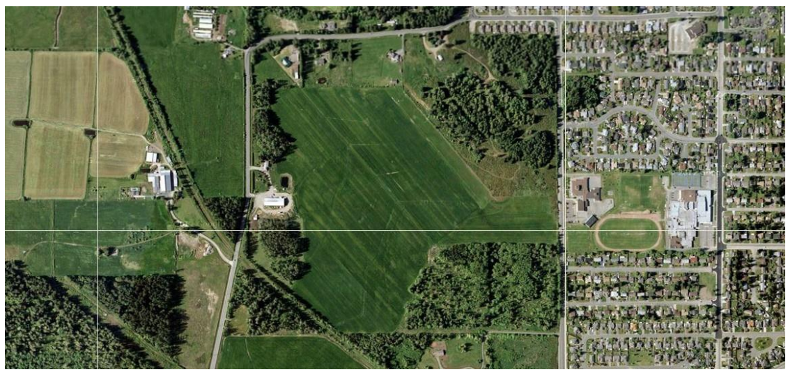
Figure 6. Residential area adjacent to active farming area in the RDN.

It is important to note that the subdivision districts<sup>1</sup> and minimum lot sizes prescribed in the zoning bylaws, if existing, override the minimum parcel sizes indicated in the OCP policies. Table 6 lists all of the zones and prescribed minimum parcel sizes for the ALR properties within the RDN.