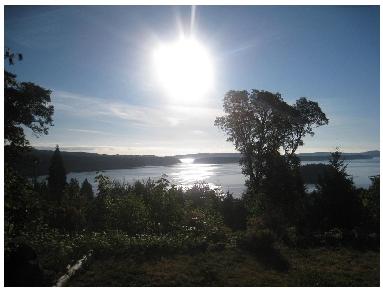
Figure 11. View of Mudge Island, Link Island, and De Courcy Island from Cedar, Electoral Area A, RDN.