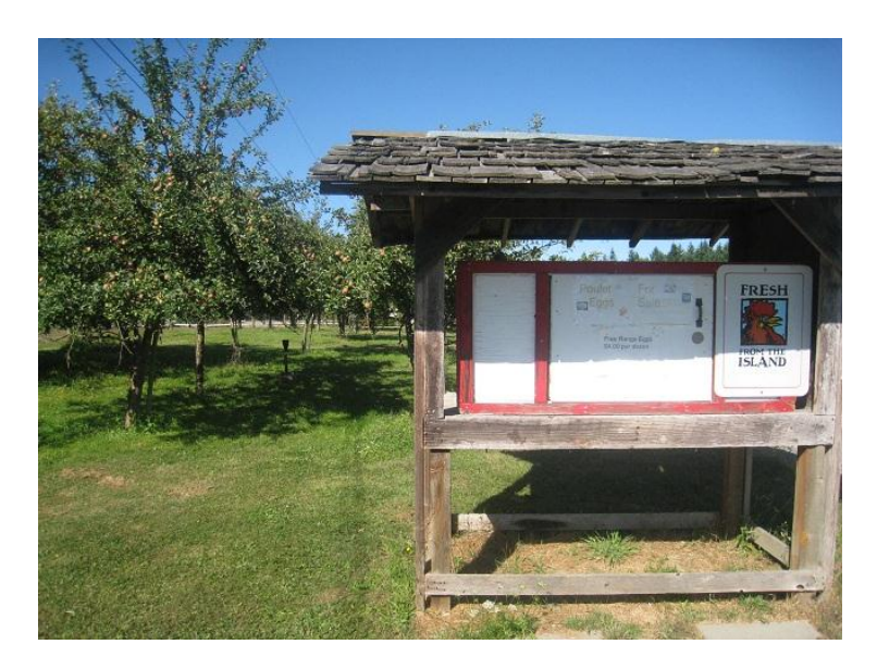
Figure 10. Farm stand in Errington/Coombs, Electoral Area F, RDN.

not be viewed in isolation from other plans and policies. It is suggested that these indicators be tracked and included with the work plan and evaluation reporting as described in Sections 7.2 and 7.3 above. In some cases Statistics Canada Agricultural Census data may only be available for update every five years. Many of the indicators used to develop the baseline information provided in the Phase 1: Background Report are issued through the Agricultural Census; therefore, this baseline data can be updated and compared over time, as data becomes available, to monitor long term trends.