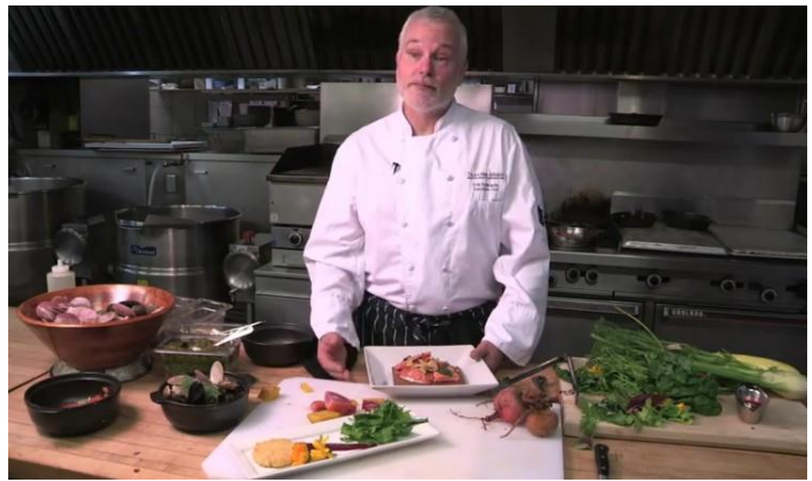
Figure 9. Showcasing local fresh ingredients at the Cedar Room restaurant, Tigh-Na-Mara Resort, Parksville.