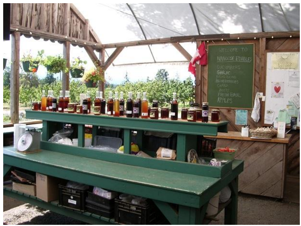
Figure 4. Nanoose Edibles Farm, Nanoose, Electoral Area E, RDN.

"Agriculture and aquaculture in the region will be valued and farmland will be protected from development. Residents will recognize agriculture and aquaculture as important industries and will respect the role of food producers within both rural and urban settings. Farms will be affordable and profitable and apprenticeships and other training programs will be locally available so that younger generations will be able to join a thriving industry. Alternative land tenure arrangements for housing family and workers on farmland will be common practice. More collaboration will occur between stakeholders and communities to promote shared resources and develop value-added products. Sustainable farming techniques will be elevated and supported. All levels of government will provide expertise and support for agriculture and aquaculture through: the provision of extension services and information; proactive planning for infrastructure, emergency management, and climate change; and the creation of bylaws and streamlined regulations that support agriculture and aquaculture".