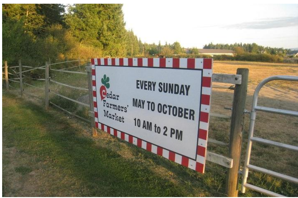
Figure 5. Cedar Farmers Market.

8.1) Create agricultural emergency management plans and guidelines to deal with emergency events.