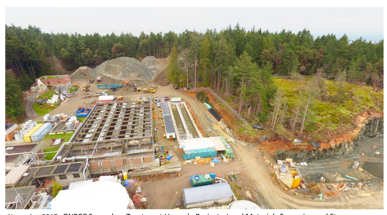
November 2017: GNPCC Secondary Treatment Upgrade Project - Local Materials Screening and Storage