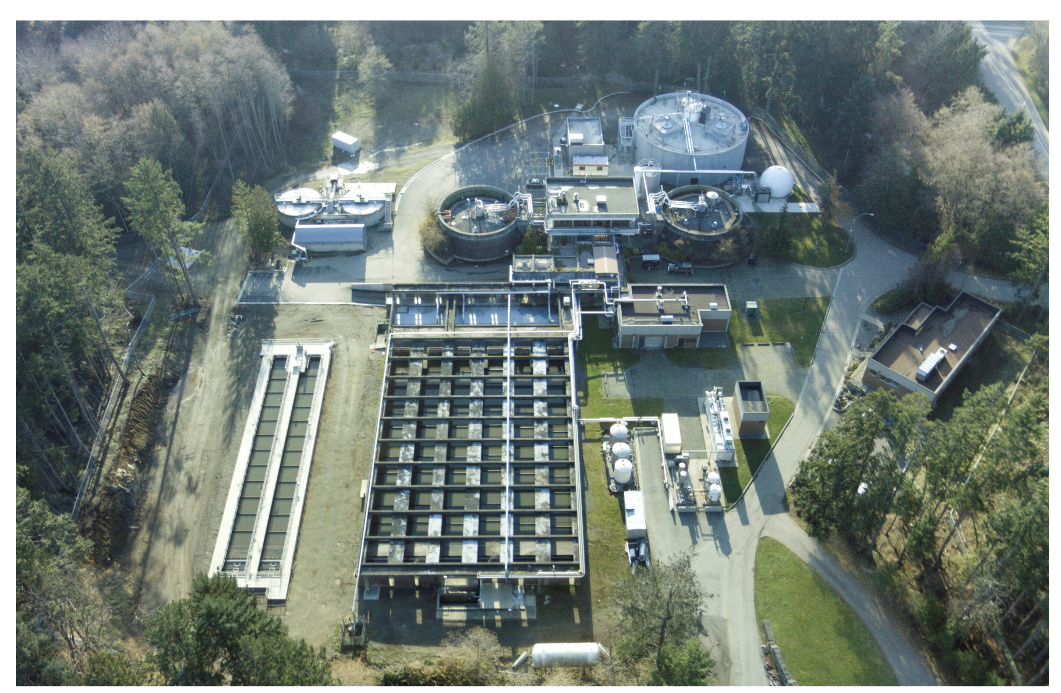
Greater Nanaimo Pollution Control Centre, 2014