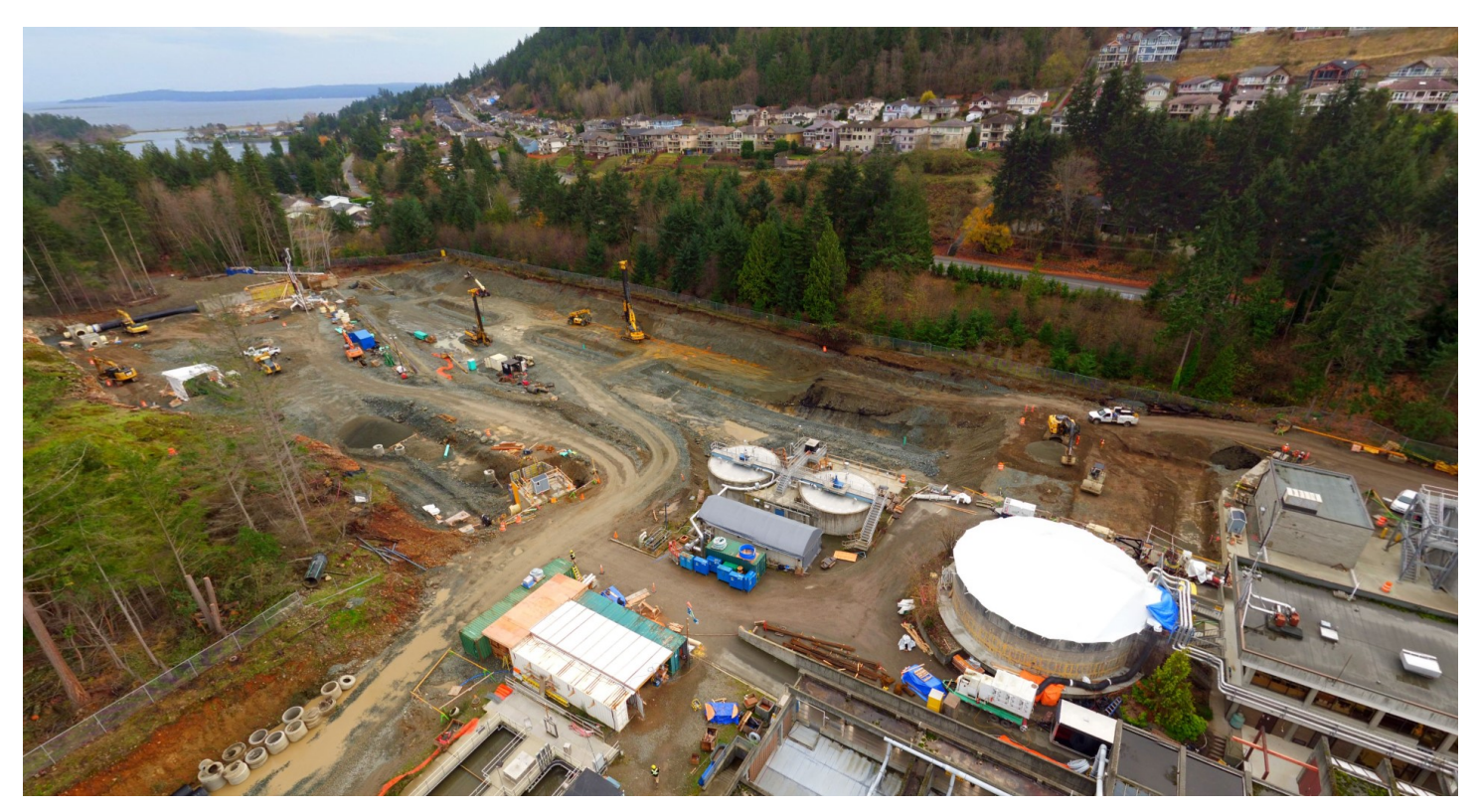
November 2017: GNPCC Secondary Treatment Upgrade Project - Stage IV Expansion Area