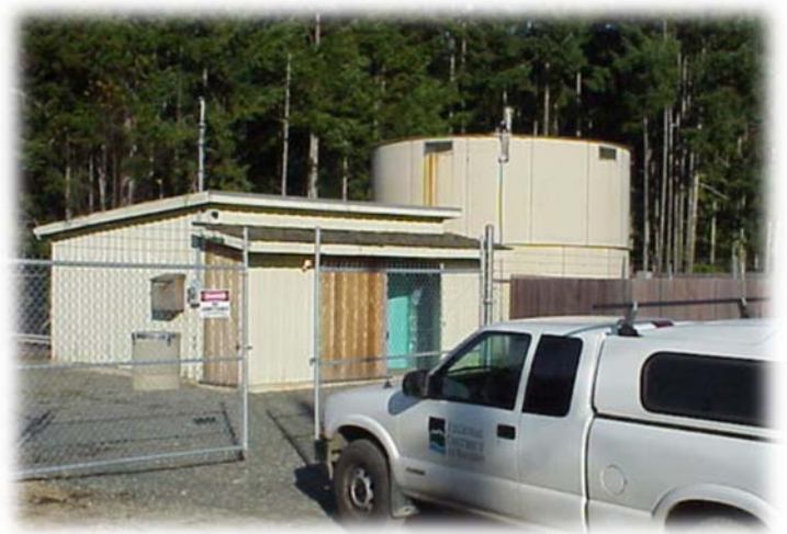
Melrose Pumphouse and Reservoir

Note: 'PVC' is poly-vinylchloride (plastic)