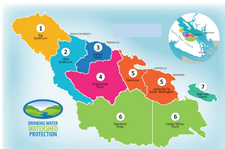
Figure 1: RDN Water Regions

The geographic scope of the program encompasses the entire RDN municipal boundary including all electoral areas and, since 2012, all four local municipalities. For example, benefits such as rebates are offered to all region residents. Implementation of science and data-related initiatives generally aligns with watershed and aquifer boundaries (see Figure 1). In some cases these boundaries overlap with surrounding regional districts.