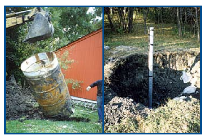
Figure 4. Well pit cribbing being removed by a backhoe