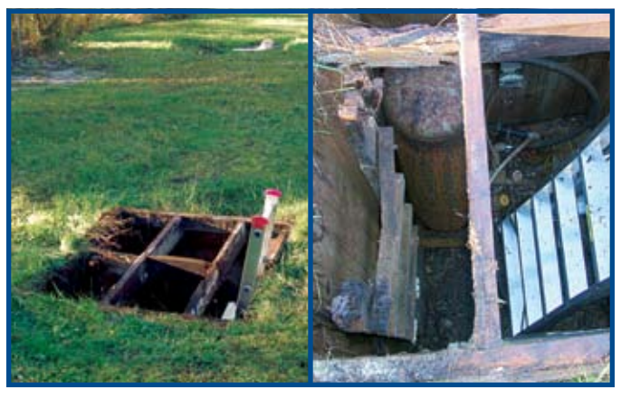
Figure 1. Well pit with wooden cribbing

Historically, well pits were commonly used to protect water line connections from freezing. A well pit is basically a large cribbing placed over the top 6-8 feet (1.8 to 2.4 meters) of the well. The well casing is cut off just above the base. Cribbing can be a square wooden structure (see Figure 1) or a circular metal structure (see Figure 2). It was common practice in the past to construct a large pit around the well to provide access to the underground water line connections below the frost line.