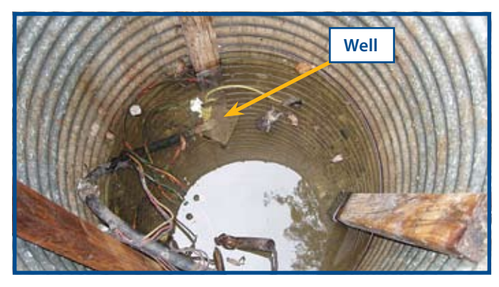
Figure 3. Water and debris in well pit