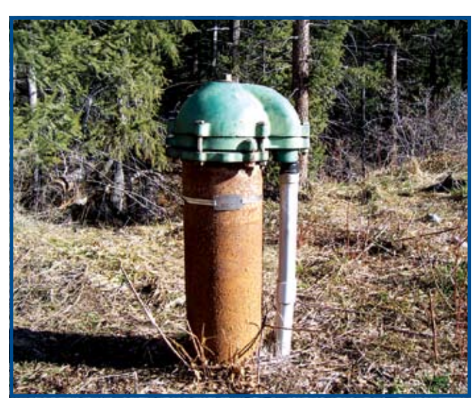
Figure 9. Secure well cap

6. Securely attach a vermin-proof and tamper-resistant well cap or lid to the casing to prevent the direct and/or unintended entry of persons and animals into the well (see Figure 9). Ensure the well cap or lid is sized to fit securely onto the well casing and should be vented to the atmosphere. Screen the open end of the air vent to prevent the entry of any insects or debris into the well. Use a check valve type of air vent to prevent flood water from entering the well in flood prone areas. Seal openings for electrical conduits entering the well.