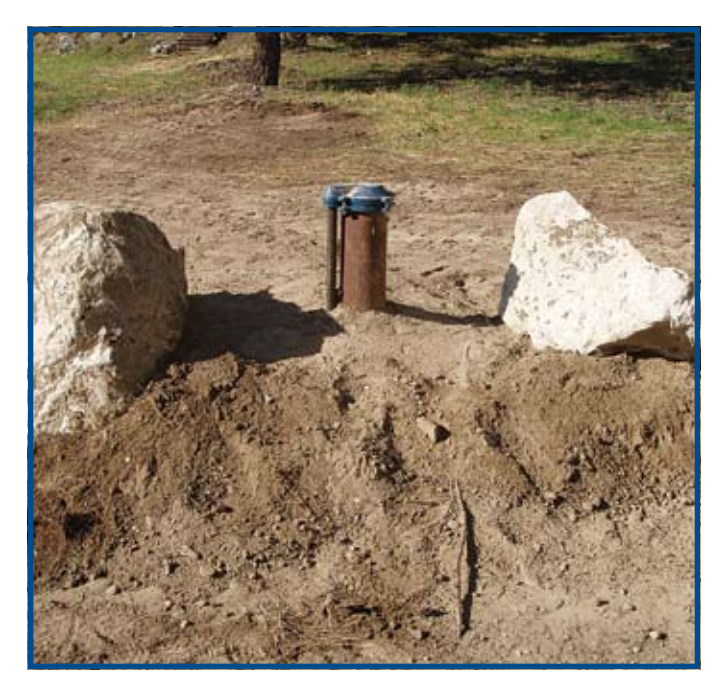
Figure 8. Grading around well head to protect well

6. Securely attach a vermin-proof and tamper-resistant well cap or lid to the casing to prevent the direct and/or unintended entry of persons and animals into the well (see Figure 9). Ensure the well cap or lid is sized to fit securely onto the well casing and should be vented to the atmosphere. Screen the open end of the air vent to prevent the entry of any insects or debris into the well. Use a check valve type of air vent to prevent flood water from entering the well in flood prone areas. Seal openings for electrical conduits entering the well.