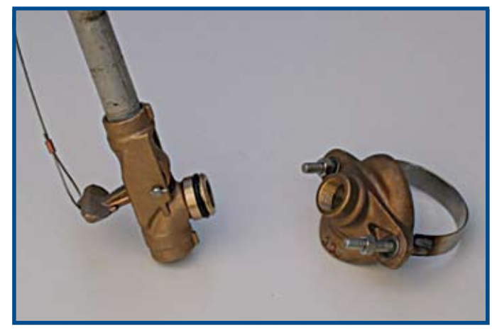
Figure 7. Pitless adapter

5. Fill the excavation hole with materials that have a lower permeability than the surrounding soil. i.e., do not fill the excavation with drain rock or pea gravel. Compact the fill. The well casing and extension must be kept vertical and inline at all times to ensure the pitless unit is not damaged or dislodged. Install a surface seal to prevent contaminants from the surface or the shallow subsurface zone from entering the well by either compacting bentonite around the extension joint and pitless adapter or placing a sono-tube around the upper casing and filling the sono-tube with a bentonite mixture. Grade the area around the top of the well in a manner that ensures adequate surface drainage away from the well and the wellhead is protected from damage (see Figure 8).