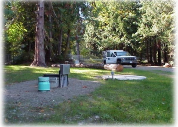
San Pareil Well Site